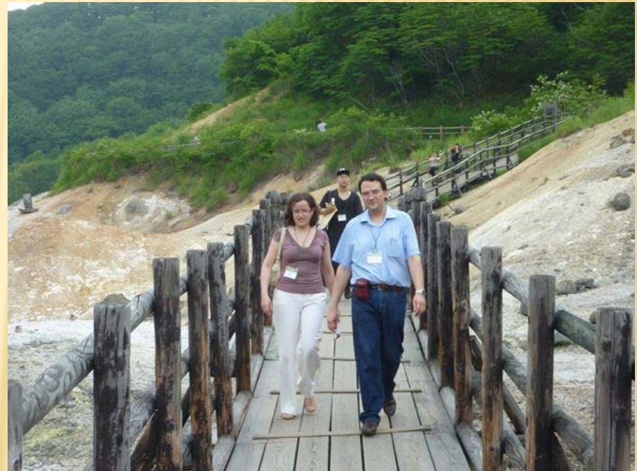
Hiking at Jigokudani