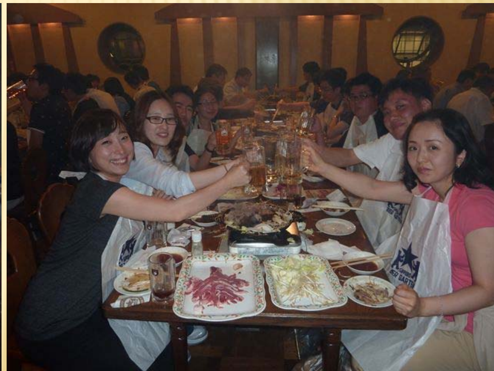
Barbecue at Sapporo Beer Garden