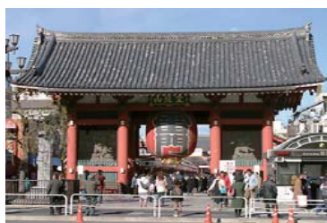
Kaminarimon Gate, Asakusa Kannon Temple