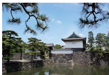
Kikyo-mon Gate, The Imperial Palace