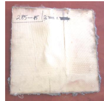
Figure 4. Ballistic protection plate rear side (after firing)

The experimental test program aimed to check the ballistic resistance (penetration resistance) and blunt trauma for .44 Magnum bullets under standard conditions.