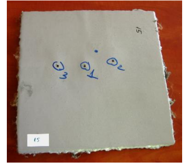
Figure 3. Ballistic protection plate front side (strike face after firing)

Determination of ballistic protection characteristics were made for a ballistic protection plate made of 10 mm thick kevlar which was covered with 3.1 mm thick layer of FRCMs. The ballistic plate was initially tested without FRCMs and the results were not satisfactory.